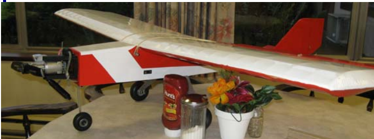
September's Raffle: Big Stik ARF

years holiday meeting. A motion was made and passed.