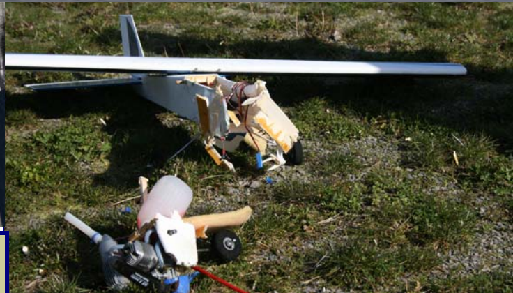
A typical weekend at the flying field.