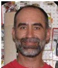
The President and his Fleet